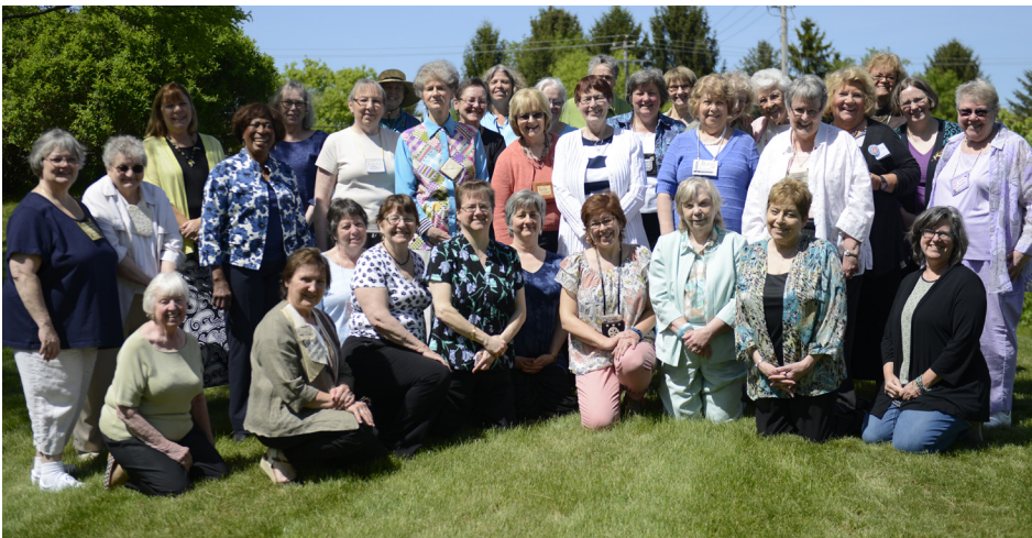
Members of the New York Capital District Chapter of EGA gathered on May 20th for a 50th Anniversary Celebration.